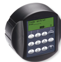
Audit lock option Revo B