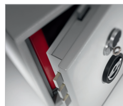
Three-way Locking Bolts

Multiple locking options (see page 5) Deposit options (see page 24)