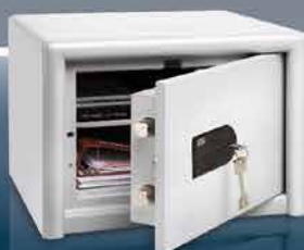
CL 10 S