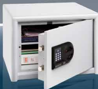
CL 20 E