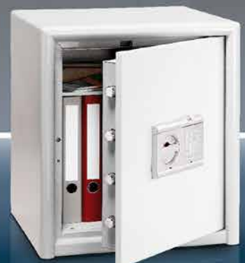
CL 40 E FS