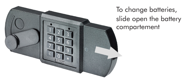
Fig. 1: Input unit Primor RE

The lock is power supplied by one 9 V block battery alkaline (no rechargeable batteries!). When battery voltage is insufficient, after entering the code a warning tone occurs repeatedly and the red LED flashes alternately. Change the battery as quickly as possible. The programmed codes stay valid during battery change. Always dispose used batteries in an environmentally friendly way.