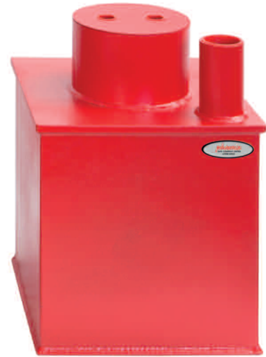
12" CUBE WITH DEPOSIT

THE PHOENIX CHARON (ROUND DOOR) UF0900 SERIES underfloor security safes has been designed to meet the requirements for a secure yet hidden safe, and comes with 4 different cash cover options.