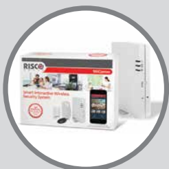
Self Installation at Professional Level, Low-Cost "Pre-Configured" Kit

A user-friendly smartphone app is included for full control of security and home safety accessories, along with a variety of expansion options that can transform the customer's security system into a scalable smart home system.