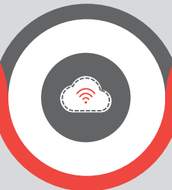
Integrated Interactive Service Platform