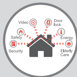
Endless On Demand Expansions For any Security, Safety & Smart Home Needs