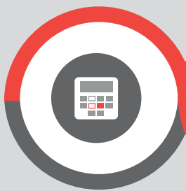
Professional Standard Security Solutions

An integrated, interactive services platform and online set-up wizard deliver superior convenience and cost-effectiveness. Which means you can now win customers over the competition with low costs and top service, while increasing recurring and overall revenues.