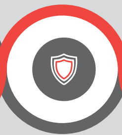
Advanced Automated Customer Management Tools