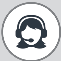
Monitoring - Self or 3 rd party Professional Monitoring