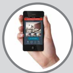
One App For Security, Video and Connected Home