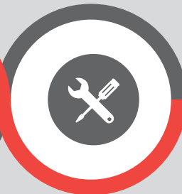
Online Direct Selling Platform