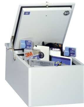
Data protection Insert FSDPI08

THE PHOENIX ARCHIVO FIRE FILE series offers unrivalled protection for documents and data† in a stylish modern filing cabinet format. Ultra lightweight insulation materials also mean the cabinet can be used on most standard floors without the need for supporting.