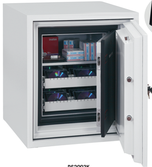
DS2003K Shown with optional extra multimedia trays