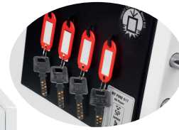
Internal Key Hooks