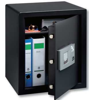
P 4 E FS