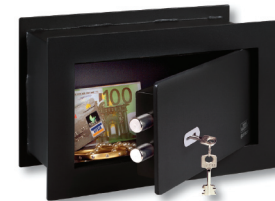
PW 1 S

Ideal for all users, key locks offer the simplest method of safe access. Supplied with two keys as standard.