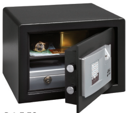
P 2 E FS