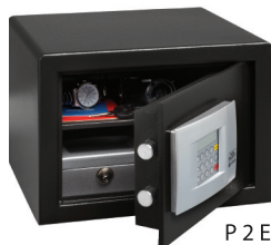
P 2 E