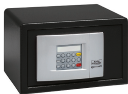
P 1 E