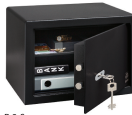
P 3 S