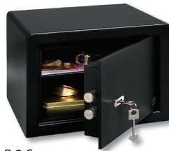
P 2 S