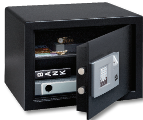
P 3 E FS