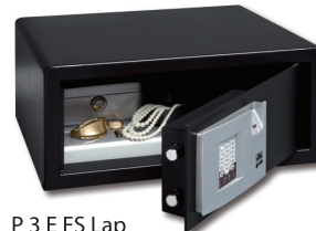
P 3 E FS Lap