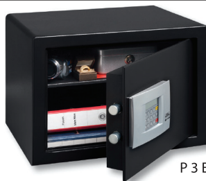
P 3 E