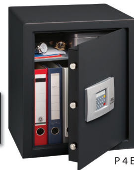
P 4 E