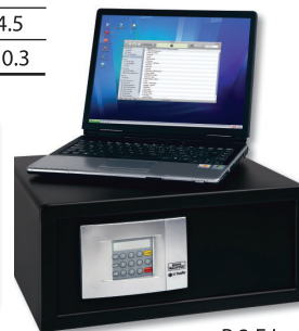
P 3 E Lap