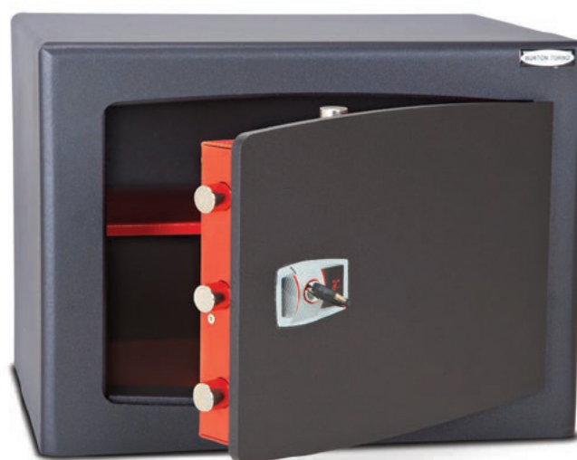
Torino Eurokey EK5